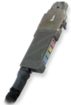
The MiniMicro™ weldhead is an "Ultra-Pure" weldhead ideal for welding tubes and fittings with controlled surface finishes and electropolished to meet ultra-pure system requirements.