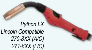
Python LX Lincoln Compatible 270-8XX (A/C) 271-8XX (L/C)

12 in. and 18 in. straight/curved Air and Water Cooled barrel options