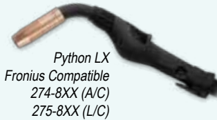
Python LX Fronius Compatible 274-8XX (A/C) 275-8XX (L/C)