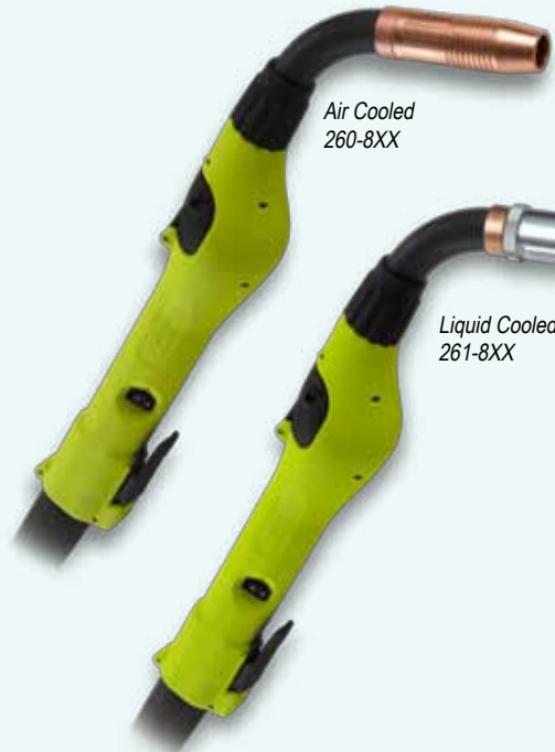
Air Cooled 260-8XX