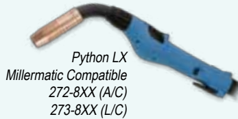
Python LX Millermatic Compatible 272-8XX (A/C) 273-8XX (L/C)